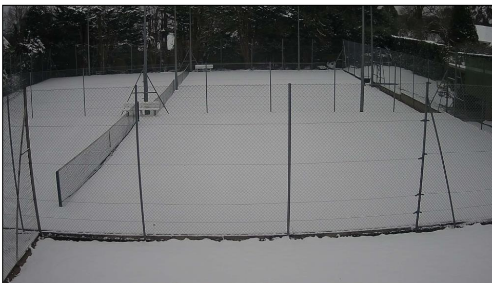
Winter webcam view on 19 th March 2018

Users of the webcam will be aware that it has not been as reliable as we would wish. The problem has been traced to moisture from the winter weather corroding a cable connection. This has been cleaned so the webcam is again working and the cable is to be renewed and re-routed to prevent a recurrence of this problem.